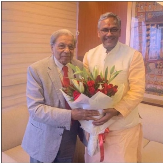
Uttarakhand Chief Minister Mr Trivendra Singh Rawat had a courtesy meeting with the Chairman of 15th Finance Commission Mr N K Singh February 6, 2020.