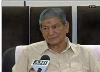
back nine legislators into its fold after they had defected to the BJP. The de-

The case was registered under Sections 7 (public servant taking gratification other than legal remuneration in respect of an official act), 8 (taking gratification, in order, by corrupt or illegal means, to influence public servant), 9 (taking gratification, for exercise of personal influence with public servant) and 12 (punishment for abetment of offences) of the Prevention of Corruption Act 1988. National High Court had, on September 30, permitted the CBI to register an FIR and commence the investigation in the alleged sting case. ANI