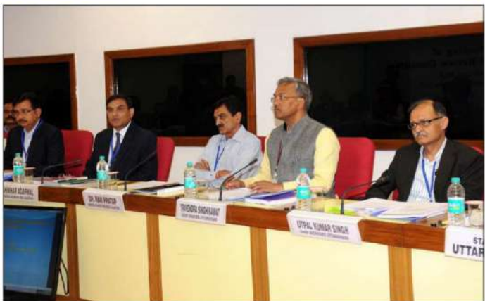
Uttarakhand Chief Minister Mr Trivendra Singh Rawat participates in the Upper Yamuna Review Committee meeting at Vigyan Bhawan in New Delhi February 15.

committee suggestions to spread awareness among potato growers about various varieties of the root to help them cultivate the varieties that are in demand by large MNCs, such as McDonald's and McCain Foods. This, he said, would help provide the state's potato farmers with a ready market for their yield on a consistent basis and at the best possible price. On the issue of maize crop, the Chief Minister wanted the committee to assess the possibility of channel production from maize/corn, as suggested by Union Transport Minister Nitin Gadkari. He asked the committee to analyse the cost benefits of such production and the remuneration it would yield for the beleaguered farmers of the state. JMT.